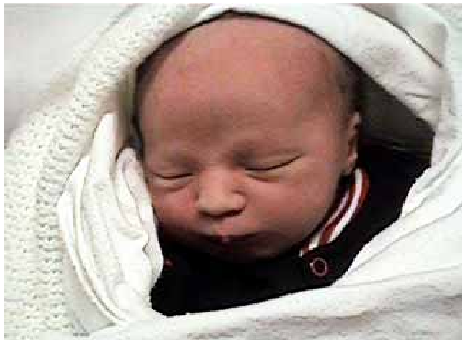
Model iQ000 Jem – in his "sleep mode"

More pictures of him can be seen at: www.shivtiel.co.uk and Email messages can be sent to: jem@shivtiel.co.uk .